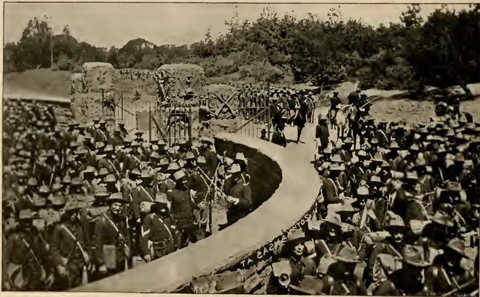
TWENTIETH KANSAS AT THE PRESIDIO GATE.